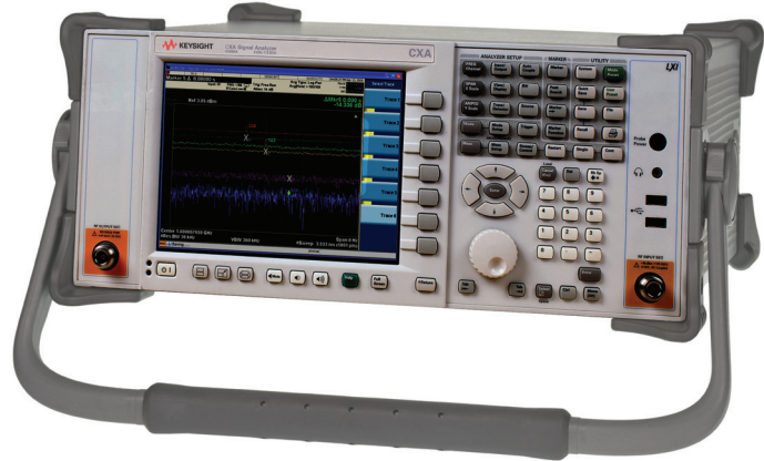
Portable configuration includes pivoting carrying handle and protective corner rubber guards (front protective cover comes standard) – N9000A-PRC